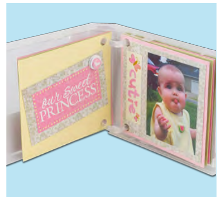
Embellish with your favorite stickers or journal the memory on the adjacent page.