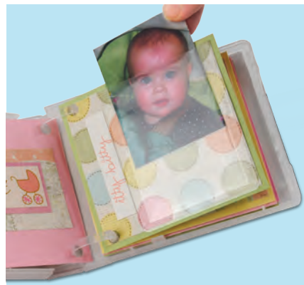
The adhesive business card pockets offer protection to your photos as well as the ability to update them as desired.