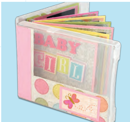
The clear wallet allows for creative interaction between the outside and contents.