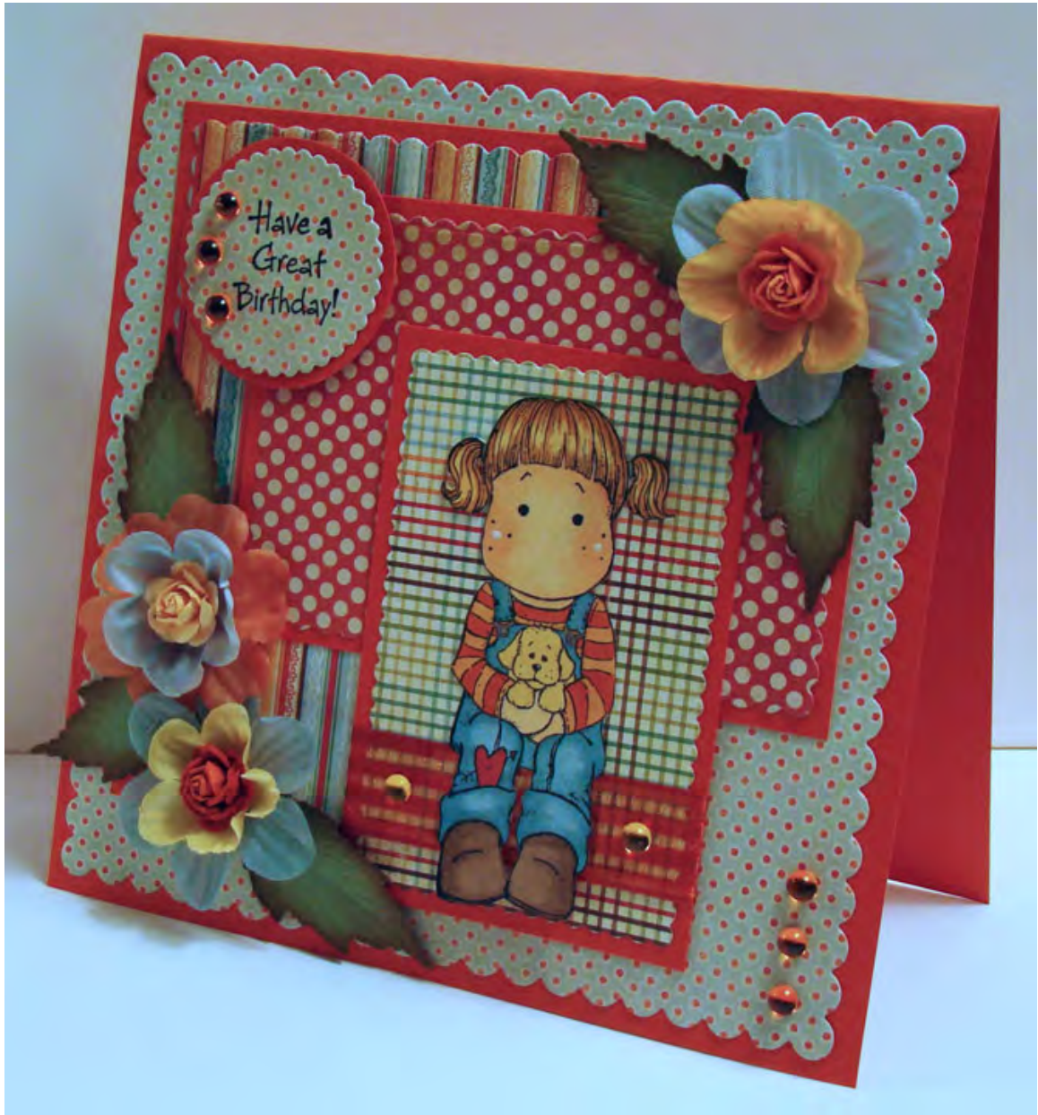
Sandy Hulsart , Design Team Coordinator, Cheery Lynn Designs

Finished size is 6" square. You can see how many different layouts can be created by moving your panels around on your card stock. This is a very quick and easy way to design a fabulous card.